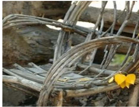
Bent Willow Furniture