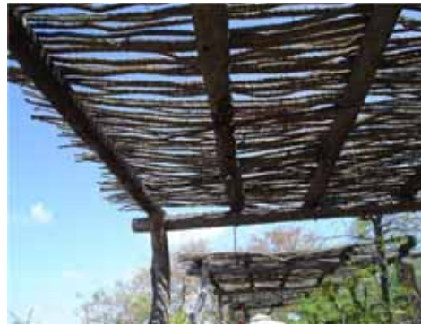
Rustic Shade Arbor